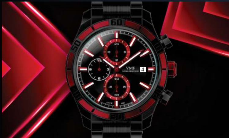
VMF NATURAL FREQUENCIES SINCE 1997